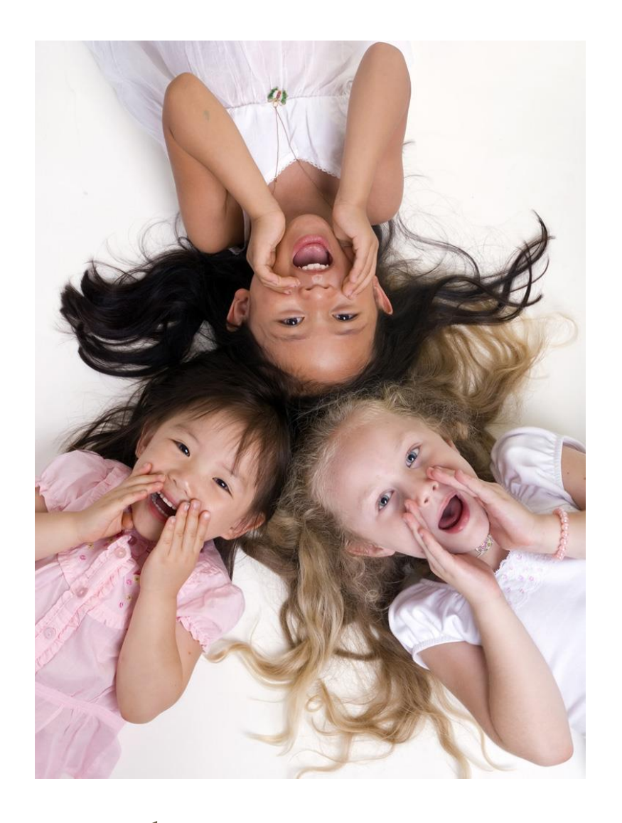
Family Services Division Child Welfare and Youth Justice